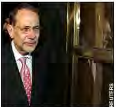
The counter-terrorism force would be controlled by Javier Solana

Such a move had been planned in the constitution which was rejected by voters in France and Holland last year. The constitution has been left on the shelf although Europe's leaders want it up and running again by 2008. Minutes of the summit show that the kernel of the counter-terrorism force, the "crisis steering group", will be operational in a fortnight.